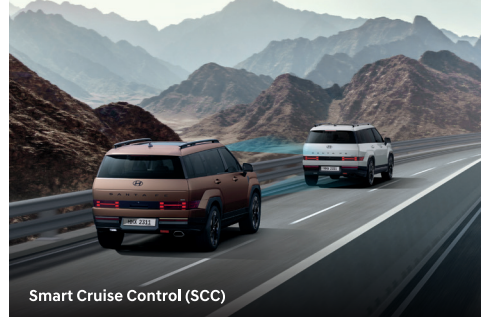
Smart Cruise Control (SCC)