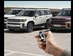
Remote Smart Parking Assist (RSPA)