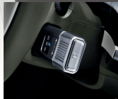
Column-Type Shift-By-Wire (SBW)