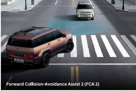
Forward Collision-Avoidance Assist 2 (FCA 2)