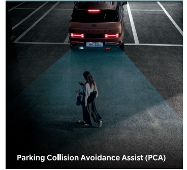
Parking Collision Avoidance Assist (PCA)