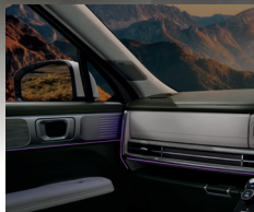
Ambient Mood Lamp