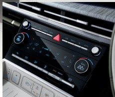
6.6-Inch Touch-Type Auto Dual Zone Climate Control AC