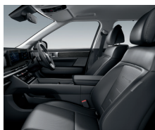
Black Monotone Leather / Charcoal Black Oak Garnish