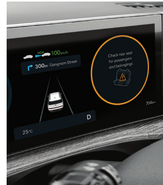
Rear Occupant Alert (Advanced ROA)