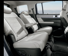
2nd-Row Captain Seat