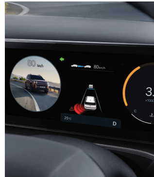
Blind-Spot View Monitor (BVM)