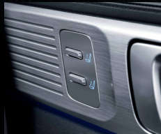
Driver Memory Seat