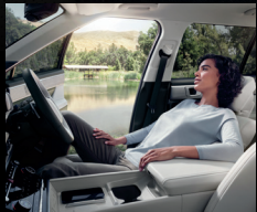
Front Relaxation Seat