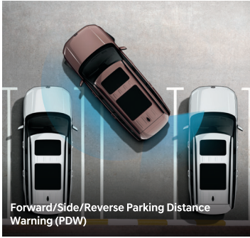
Forward/Side/Reverse Parking Distance Warning (PDW)