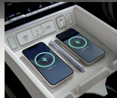
Dual Wireless Smartphone Charging Pad (Qi Standard)