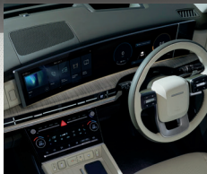
12.3-Inch Panoramic Curved Display