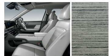
Forest Green Nappa Leather / Eucalyptus Stripe Light Garnish Only for Calligraphy.