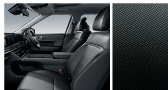
Black Monotone Nappa Leather / Black Ink Metal Garnish Only for Calligraphy.