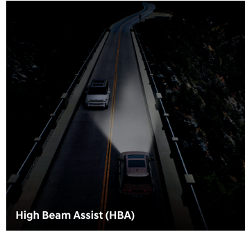
High Beam Assist (HBA)