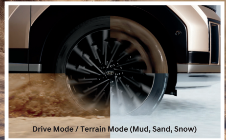
Drive Mode / Terrain Mode (Mud, Sand, Snow)

4WD HTRAC SANTA FE AWD provides optimal driving performance by actively distributing driving forces to the front and rear wheels depending on the situation.