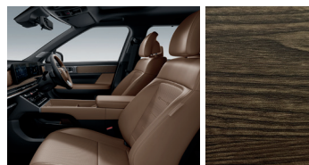
Pecan Brown Nappa Leather / Natural Serenity Oak Garnish Only for Calligraphy.