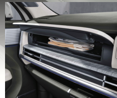
UV-C Sterilization Multi-Tray