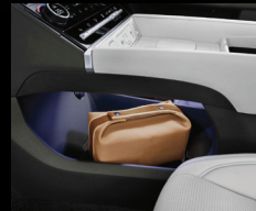
Front Upper-Tray Under Floor Box