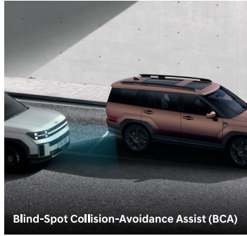
Blind-Spot Collision-Avoidance Assist (BCA)