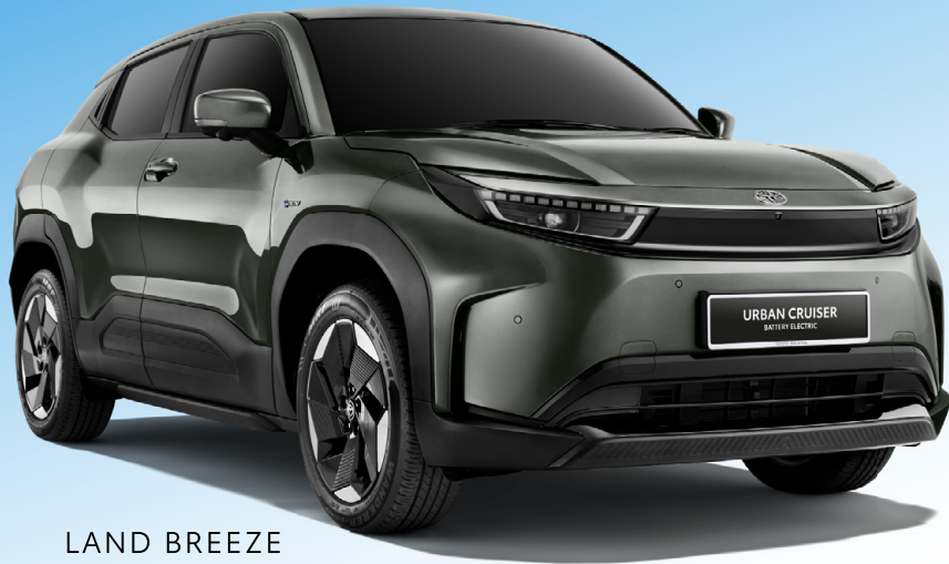
LAND BREEZE GREEN (WA1)