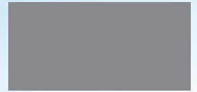
GRANDEUR GREY (WBF)