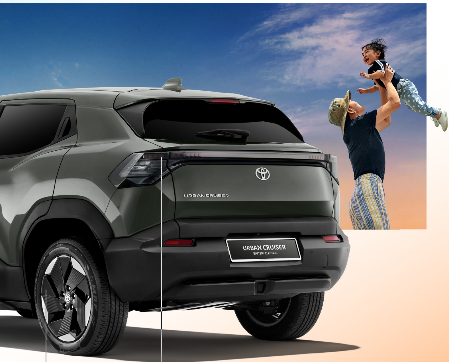
18" Aluminium Wheels

Seamlessly blending form and function, it delivers bright, clear illumination for safe and confident drives.